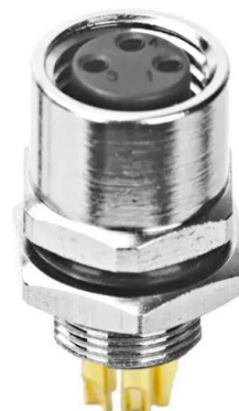
3 position female connector

IP67 M8 straight shielded PCB Panel Mount 3 or 4 pin A coded connector. Designed for Sensors, actuators, and industrial controllers. 8mm threaded joint, quick easy mating and locking, even in places difficult to reach. Anti-vibration locking design.