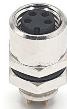
4 position female connector