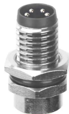
4 pin male connector