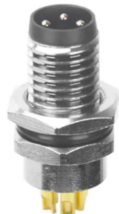
3 pin male connector

IP67 M8 straight shielded PCB Panel Mount 3 or 4 pin A coded connector. Designed for Sensors, actuators, and industrial controllers. 8mm threaded joint, quick easy mating and locking, even in places difficult to reach. Anti-vibration locking design.